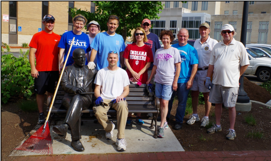
Rotarians at their best