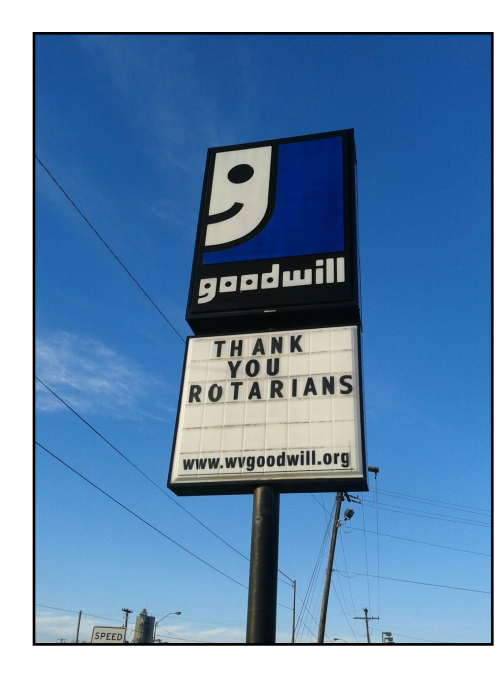
Mark your calendar Rotary/Goodwill Drive