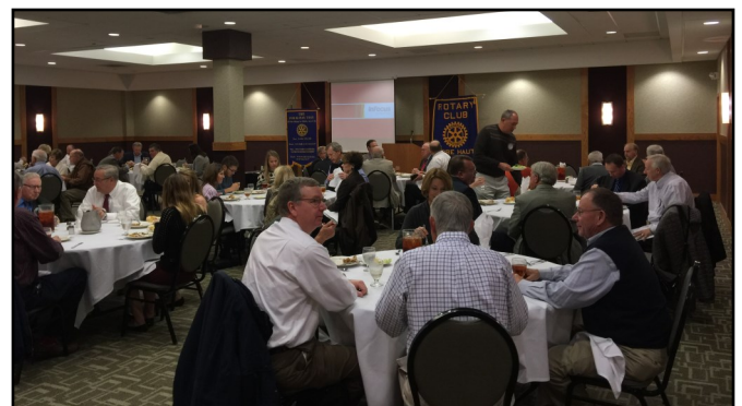
Our first meeting at Meadows Banquet Center - Nov. 17