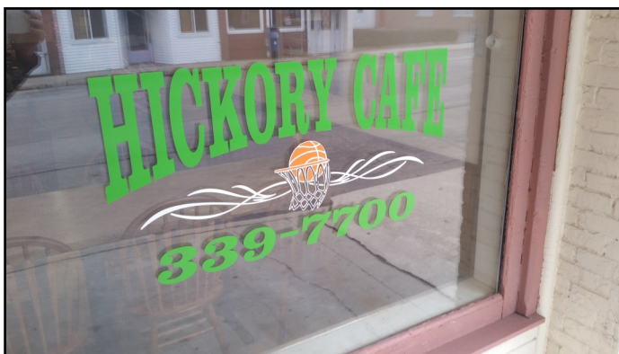
The barbershop in Hoosiers "where Coach Norman Dale confronted the town fathers" is now the Hickory Cafe in New Richmond located a short distance from Crawfordsville.