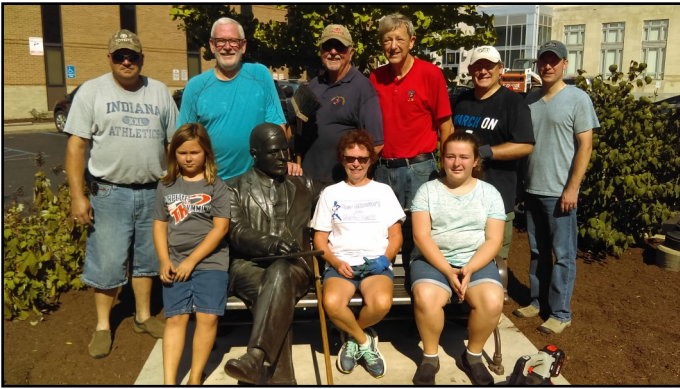
Rotarians and guest helpers worked to beautify Ehrmann Plaza